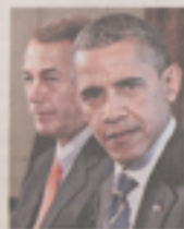
President Barack Obama, with House

"The key to their success will be in their relationship